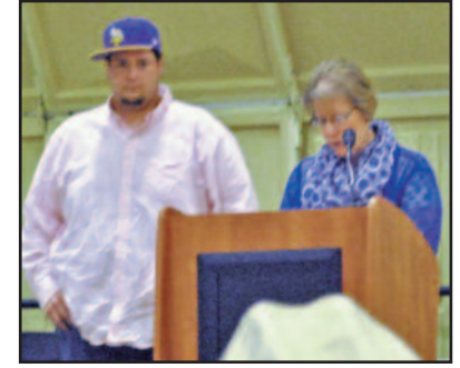
The Zane Lee Hoffman Memorial Scholarship presented.